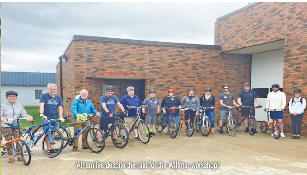
All smiles despite the rain for the Willmar workshop!