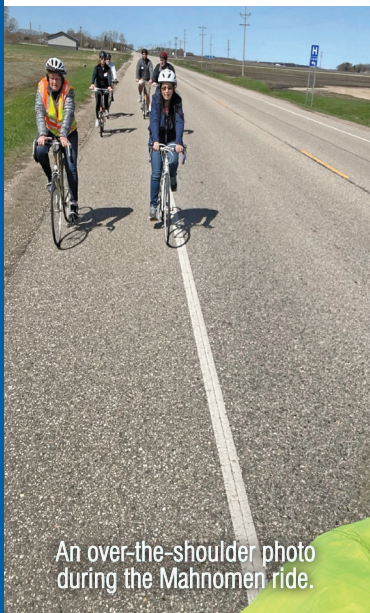
An over-the-shoulder photo during the Mahanomen ride.