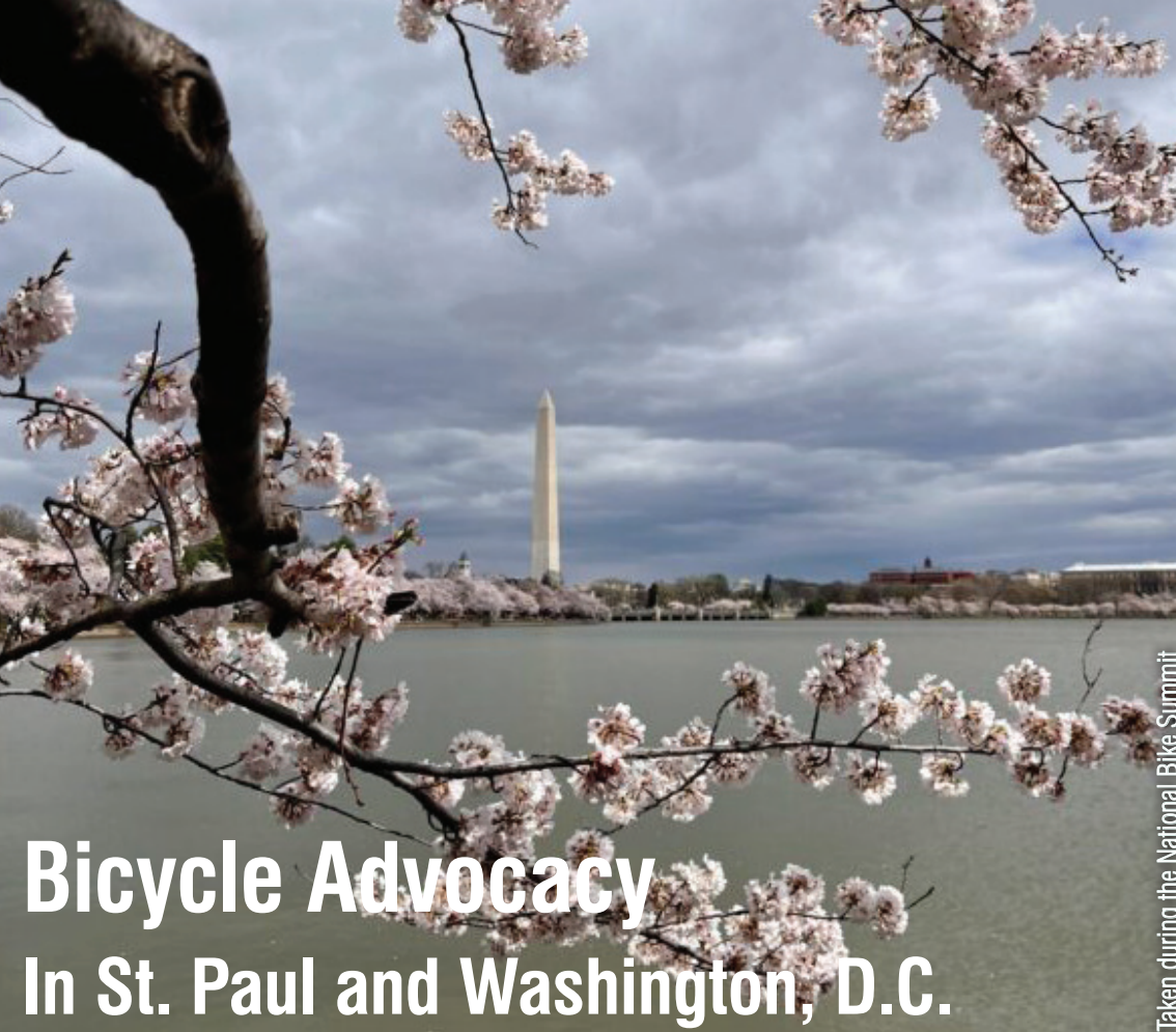
Taken during the National Bike Summit