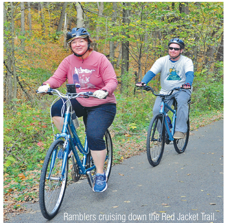
Ramblers cruising down the Red Jacket Trail.